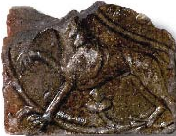
A 12th C floor tile from The Cistercian Convent at North Berwick

The tradition of decorated tiled floors largely died out in Britain at the Reformation in the late 16th C, and plain tiles were used thereafter. It was in imitation of medieval styles and techniques that a harder ceramic type floor tile became popular again in the mid 19th century as part of the gothic revival. Patterns changed over the 19th century until tile flooring went out of fashion in the 1920s. Subsequent tastes led to such floors being covered up, or removed, sometimes following damage or loosening of the constituent pieces.