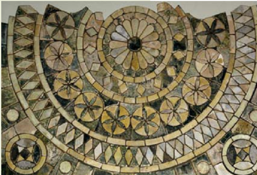
12th C Cut work from Byland Abbey, Yorkshire. Scan No000-000- 569-006-C

Although intact survivals from early periods are rare, fired clay tiles have been in domestic use since the Middle Ages. While most early floors were of stone, the use of fired ceramic clay tiles, sometimes decorated, was common in high status and ecclesiastical settings. High status flooring also used a technique called opus sectile ('cut work') to combine cut marble with segments of porphyry (a hard purple coloured rock used by the ancients and later removed from classical ruins). The best surviving example of such work is the pavement in the choir of Westminster Abbey which dates from the 1380s, although fragments have been found at Byland Abbey in Yorkshire and in situ at Melrose Abbey in the Borders. There is evidence for the manufacture and use of glazed tiles at the Cistercian Convent at North Berwick and in many other ecclesiastical establishments in Scotland, including the Abbeys at Melrose, Newbottle and Glenluce.