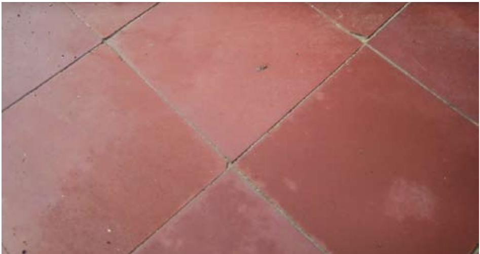
Early 20th century quarry tiles.

century. They were frequently used in halls, service areas and kitchens. Originally they were associated with the Arts and Craft movement and are still produced today.