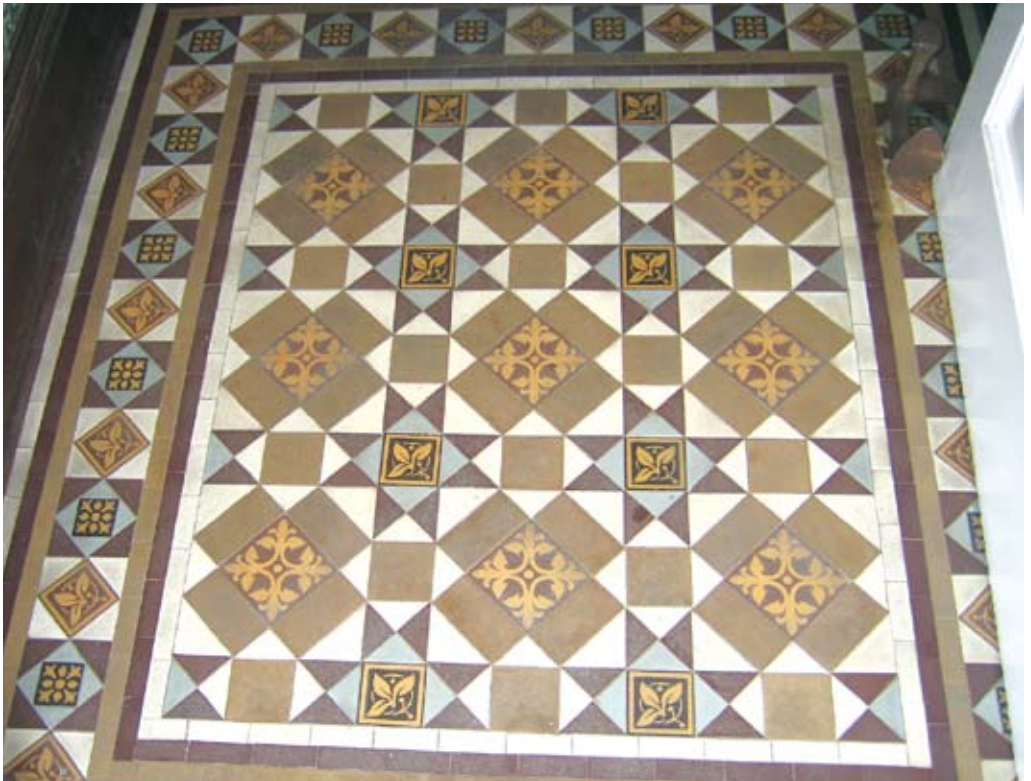
An early 20th century hall floor in Perthshire, with encaustic (decorated) tiles

The tradition of decorated tiled floors largely died out in Britain at the Reformation in the late 16th C, and plain tiles were used thereafter. It was in imitation of medieval styles and techniques that a harder ceramic type floor tile became popular again in the mid 19th century as part of the gothic revival. Patterns changed over the 19th century until tile flooring went out of fashion in the 1920s. Subsequent tastes led to such floors being covered up, or removed, sometimes following damage or loosening of the constituent pieces.