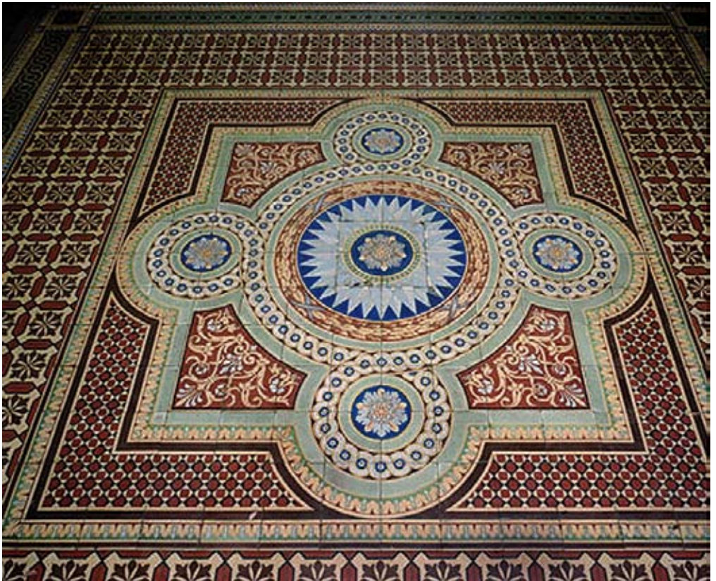
Polished encaustic tiles in a late 19th C hallway in Aberdeen.

For loose tiles that remain in their original position, an acrylic resin or PVA glue is a good way of consolidating them in situ. Remove all old grout and dust prior to running the glue into the gaps. Agitation of the loose pieces will ensure proper distribution of the glue around the base of the loose segments. Allow the glue to partially set and then work cement or lime grout into any remaining cracks by hand, ensuring that any excess glue and cement is removed with a wet cloth.