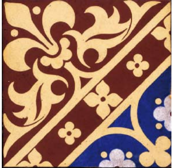
A Victorian Encaustic Tile. Scan No 000-000-477-350-C

Other forms of tiling were also developed during the 19th C. Probably best known is the quarry tile. This was a fired terracotta-coloured clay tile of satin or matt finish. Due to lower firing temperatures and less refined clays, they tended to be softer. But regardless of age, most quarry tiles were laid in a grid pattern, but other shapes and patterns were used, including hexagons and polygons, that could be laid among stone or slate slabs. Produced in a range of sizes, the most common sizes are approximately 100mm and 60mm square, with the smaller sizes coming into use at the turn of the 20th