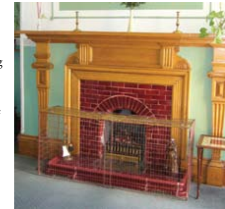
A fire guard in place