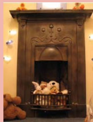
A re-furbished fireplace before and after work