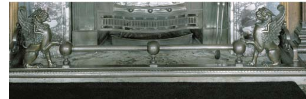
A highly decorative fender