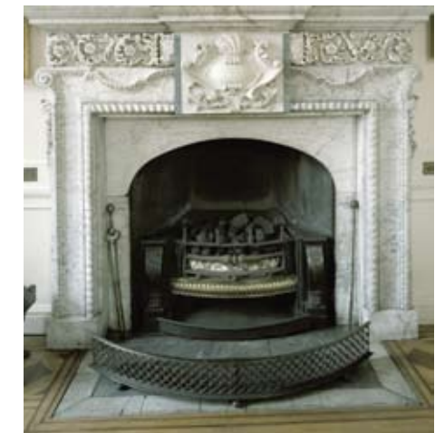
Decorative marble chimney piece