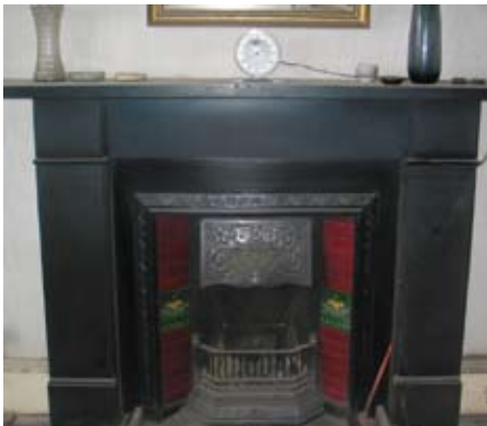
Wooden chimney piece painted to resemble slate