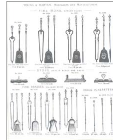
A selection of fire place accessories