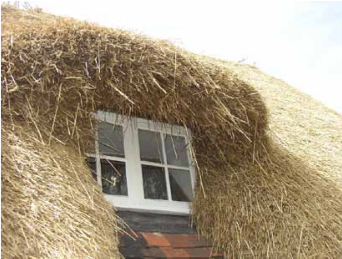
09 An 'eyebrow' dormer in a newly thatched roof before final trimming