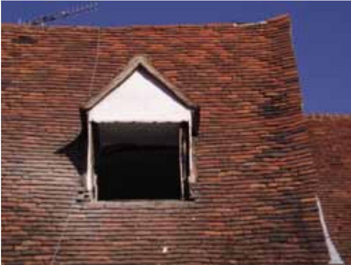
07 The cheeks which are often the narrowest part of a dormer window can be challenging to upgrade

The cheeks which are often the narrowest part of a dormer window can be challenging to upgrade as it is often very difficult to install a useful thickness of insulation whilst also creating the ventilation paths which are preferred. In most cases it will not be possible to change the proportions of the dormer at all and at best by the width of a counter-batten (25mm) in the others. If more flexibility exists, for example if the dormer faces into a hidden valley, then better results can be achieved.