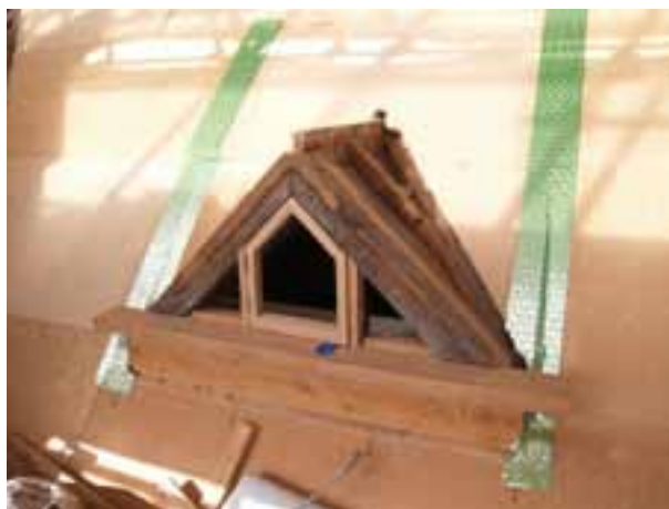
II The repaired dormer surrounded by wood fibre sarking insulation board. The joints have been taped to maintain air-tightness