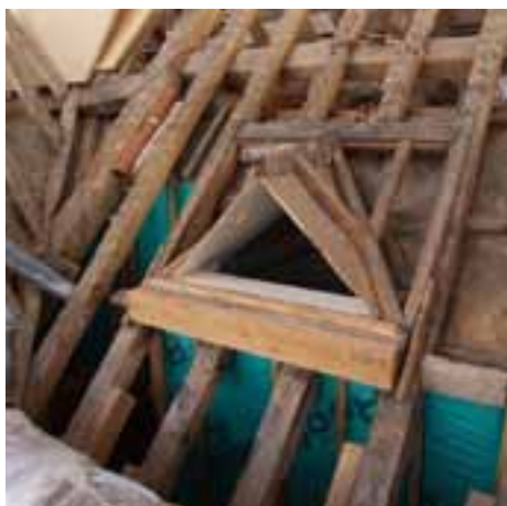
I0 This simple apex dormer is relatively easy to upgrade along with the adjacent roof repair works