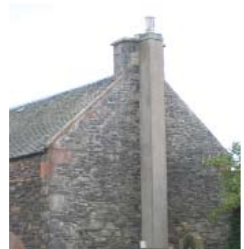
A new flue on the outside face of the gable