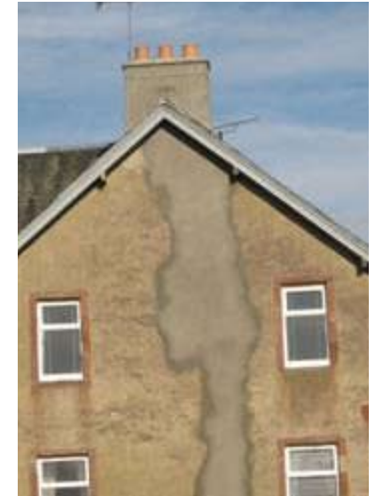
A flue relined from the outside.

flue and due to the cementitious nature of the poured material, does not allow proper movement of water vapour within the wall. If the wall and flue are dry or internal, it can be effective, but caution should be exercised when considering this method for external gables or exposed chimneys.