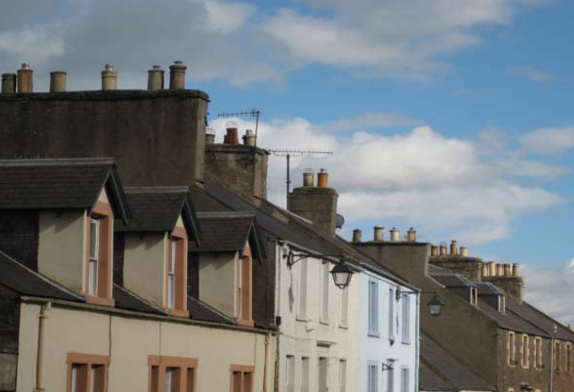
Chimneys and cans are a dominant and distinctive feature of the urban environment.

The chimney and flue system are an integral part of the structure, function and aesthetic composition of a traditional building and often the streetscape in which the building sits. They are structural elements that require care and maintenance, although due to the location this is frequently omitted. This Inform will outline the basic elements of a flue and chimney system and identify common faults, their diagnosis and the principles of how to deal with them.