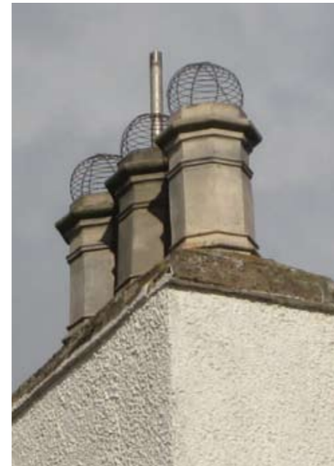
19th C Cans with bird grilles.