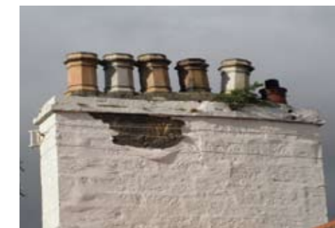
A mid 19th C chimney and cans showing a variety of problems.

Chimney Cans. Over time, the haunching washes out or becomes cracked, and the chimney pots, or cans become loose. This will require re-bedding in fresh mortar. Occasionally the can itself becomes cracked and broken and they should be replaced. Invariably styles are limited, but cans should be matched where possible - in height and colour as a minimum. If the fire is not used the can should be covered, preferably with a conical galvanised cover fitted with bird netting. Ceramic covers are available, but do limit ventilation somewhat. If there is evidence of damp in the chimney they should not be used.