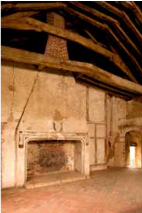
01 Fireplace in the first floor bedchamber at Castle Acre Priory

The earliest brick chimneys were built over traditional open hearths. Wood consumption was high, as most of the heat went up the chimney with the smoke, while cold air was sucked in from the outside through the leaky building fabric.