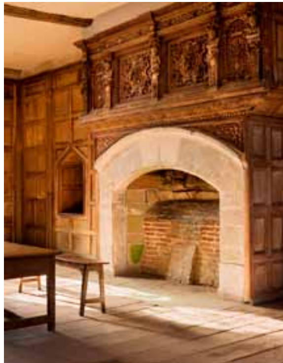
02 Fireplace in the solar at Stokesay Castle with 17thC carved overmantel

As comfort standards improved and buildings became more compartmentalised, smaller fireplaces were required in more parts of the building. This trend was aided by the growing availability of coal in the 17th and 18th centuries, especially in urban areas. Coal burns more efficiently than wood, providing more heat from a smaller fire. Coal fires benefit from being in a grate that allows more oxygen to reach the burning coal.