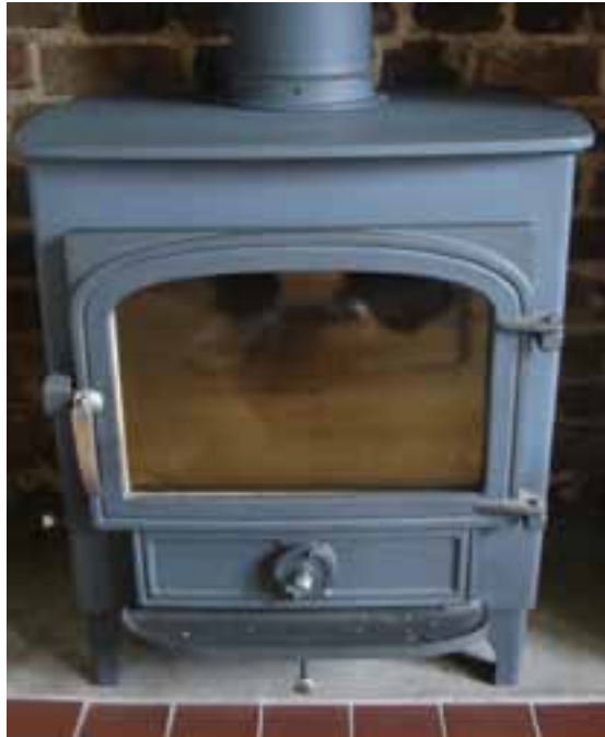
09 Stoves burn fuel much more efficiently than open fires and cause fewer draughts.

Room heaters or stoves must be installed by a 'competent person', e.g. an engineer registered with HETAS for solid fuel, OFTEC for oil or Gas Safe for gas. The flue gas temperatures from a room heater can be significantly more than from an open fire so care is needed to reduce the risk of fire or heat damage. A flue liner will always be required; and if a flexible metal liner is used it should be double skinned. Some chimneys may not be capable of accommodating an adequate liner and so will be unsuitable for a room heater.