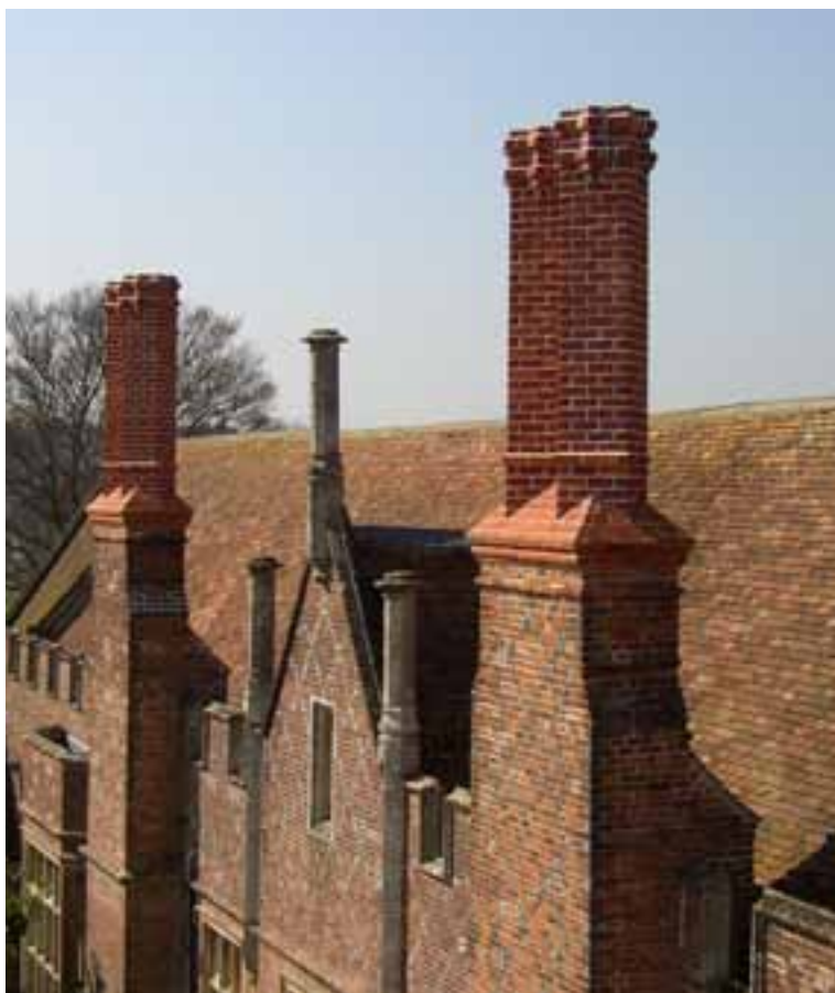
05 Chimneys are often prominent and significant parts of historic buildings

A person registered by Ascertiva Group Ltd, Association of Plumbing and Heating Contractors (Certification) Ltd, Benchmark Certification Ltd, Building Engineering Services Accreditation Ltd, ECA Certification Ltd, HETAS Ltd, NAPIT Registration Ltd or Oil Firing Technical Association Ltd.