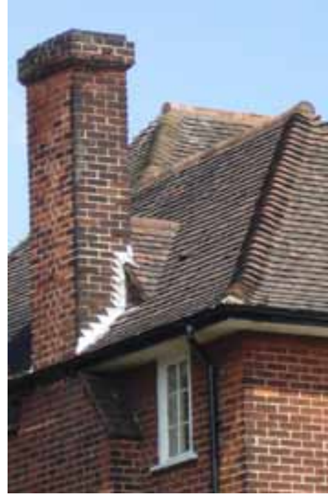
06 Chimneys are often prominent and significant parts of historic buildings