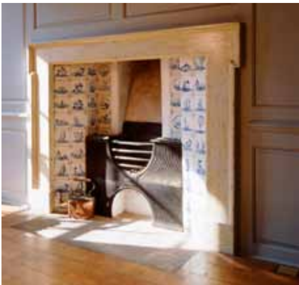
03 An 18thC cast iron grate in a fireplace at the Great Yarmouth Row Houses

The fabric of chimneys in historic buildings and debris that accumulates in disused chimneys can be of archaeological importance. Care should be taken not to lose historic fabric during the opening up of old flues or during the process of making alterations to flues in historic buildings. Listed Building Consent may also be required.