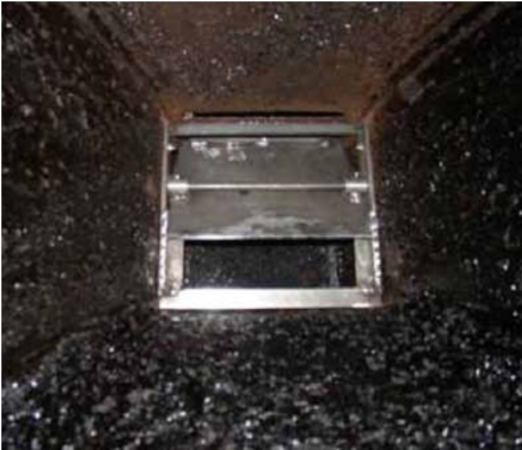
07 A damper fitted within a flue.

A chimney for an open fire will be a cause significant draughts when it is not in use. A good remedy for this is to fit a damper, which can be installed either in the throat of the chimney, the flue, or at the top of the chimney. The best types are easily opened and closed using a handle that also indicates the position of the damper flap. Dampers should not block all the air entering the chimney as a small permanent flow is necessary to ventilate the flue when it is not in use. If a gas appliance is to be used, any damper must be fixed in the permanently open position.