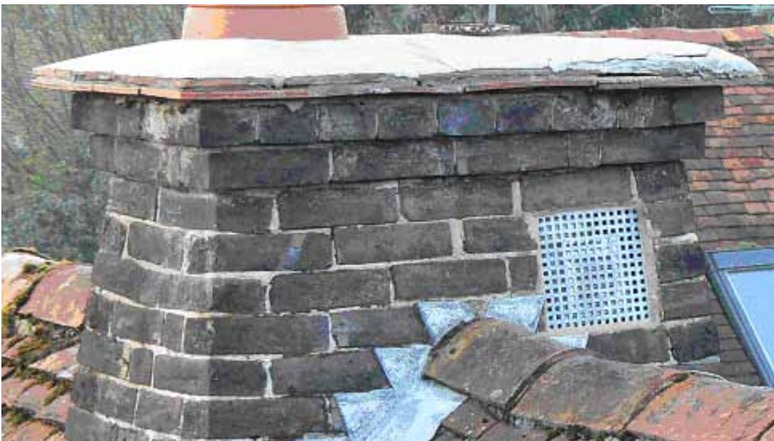
10 A flue used for an extractor fan on the back of the chimney.

All disused flues require regular maintenance. The greatest risk is from birds' nests or other debris entering the chimney from above, or from building debris (old parging or broken withes) from the flues themselves. Either form of debris can block flues in unexpected places, leading to damp, smells, staining and other problems. The simplest way to check for and clear such debris is to have the disused flues swept.