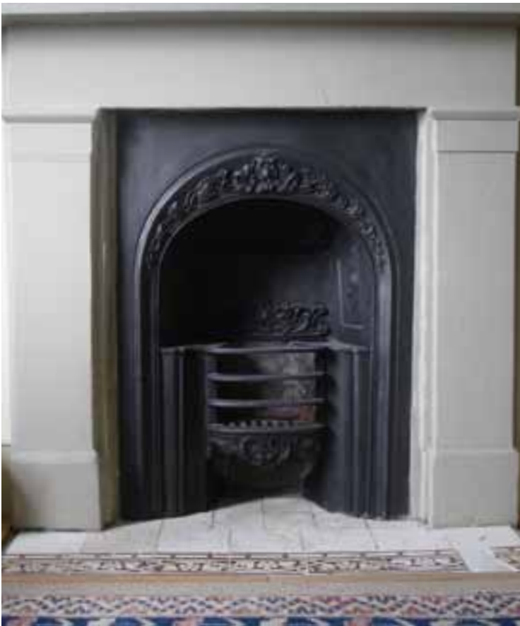
08 Cast iron fireplaces such as this one often incorporated built in dampers to restrict draughts when the fireplace was not in use.