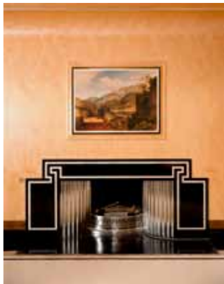
04 An inter-war fireplace at Eltham Palace