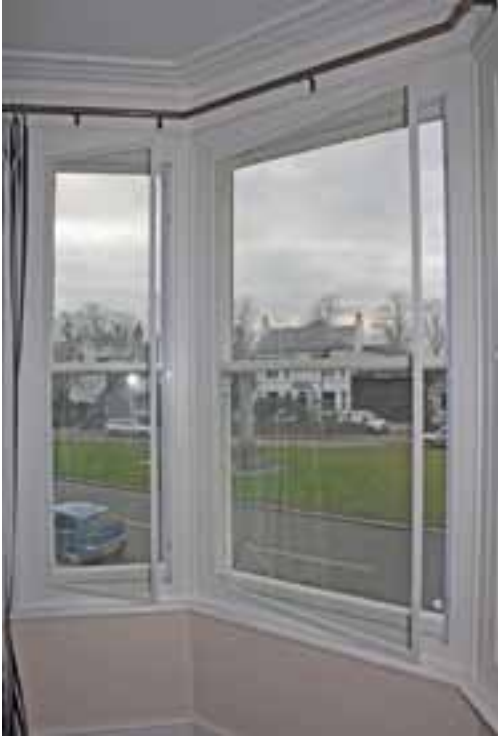
07 Side hung casement secondary units fitted to double hung sash window