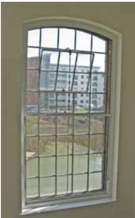
I1 Vertical sliding secondary sashes used with a cast iron window

The design of the original window can be used to determine the style of the secondary glazing to be installed. The dimensions of the primary window are fixed but the secondary glazing can be designed into manageable sized units.