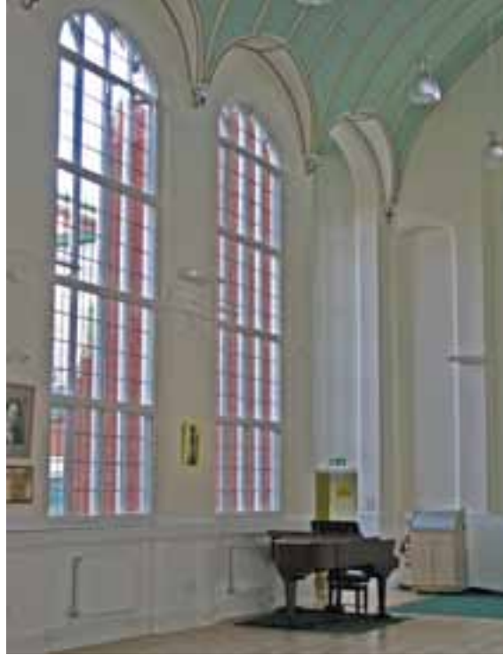
08 Fixed secondary units added to high leaded windows