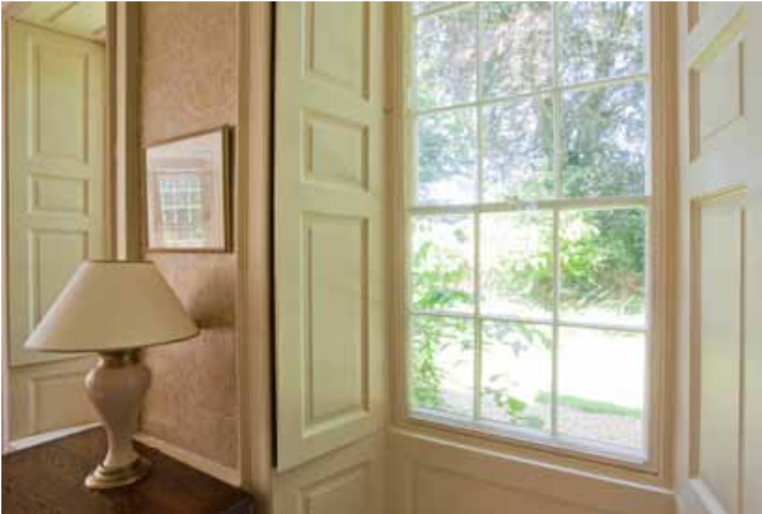
14 Slim profile secondary glazing used in conjunction with opening shutters