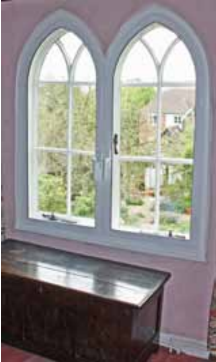
09 Curved headed secondary casements

There are limitations but it is possible to shape all styles of secondary glazed units to the shape and style of the external window.