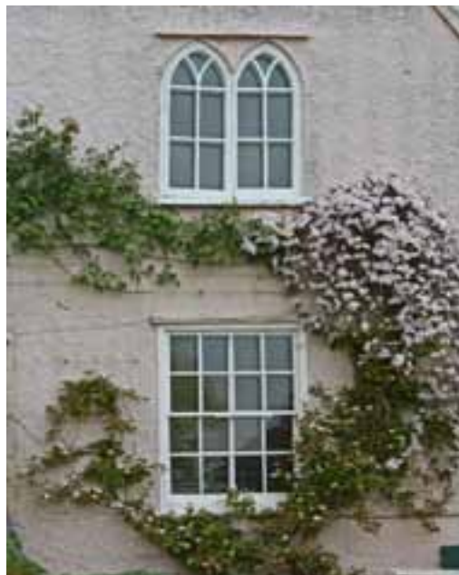
16 secondary glazing added to these windows makes no visual impact externally