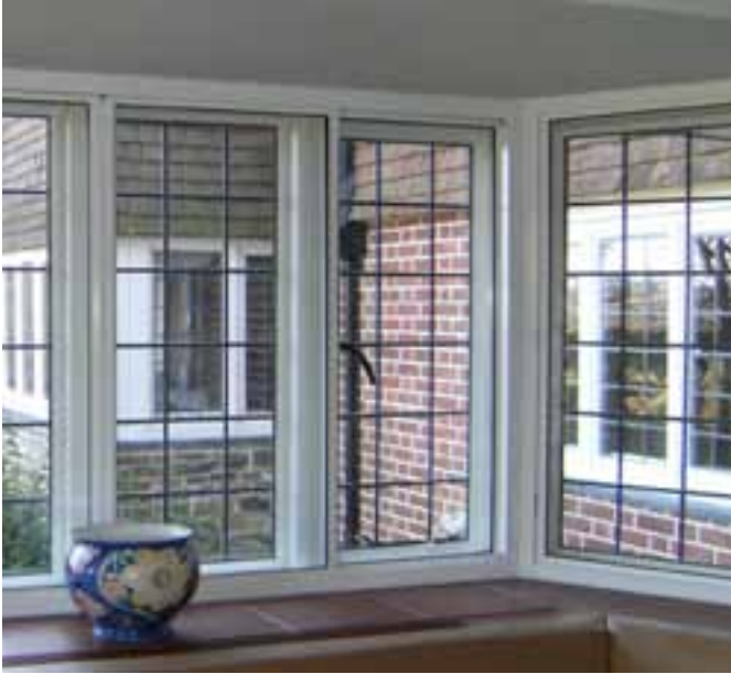
05 Horizontal sliding secondary sashes used with a leaded light window