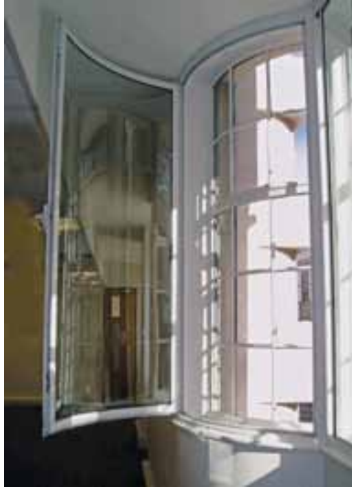
10 Special secondary glazing units can be made