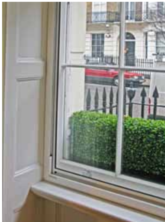
I2 Secondary glazing carefully incorporated with window reveal panelling