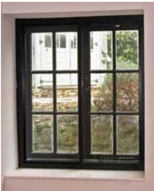
15 A secondary glazing unit colour matched to the primary window for minimal impact

Secondary glazing can be visually intrusive externally and internally if badly designed. To minimise the visual effect of secondary windows externally, try to make sure the secondary glazing is not smaller than the glazed area of the existing window. Try to place any divisions in the glazing behind the window meeting rails or glazing bars. The flat reflections of modern glass within secondary glazing can be minimised by using anti-reflective glass.