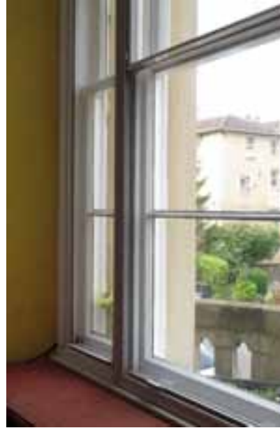
06 Vertical sliding secondary sashes used with a double hung sash window