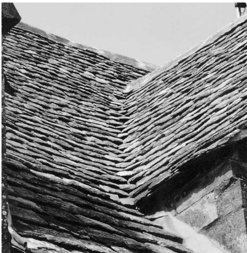
The swept valley. This detail requires the most skilled craftsmanship in its construction, involving the careful shaping and fixing of the wedge shaped slates in the valley. Often, modern roofers omit this and insert a close-mitred or open lead valley. Although both of these are cheaper to construct, neither appear as satisfactory as the traditional valley and are best avoided.

At the valley, specially cut slates would be used, designed to form a gentle curve to the roof. Some 'swept valleys' were laid to a tighter pattern, with slates laid two-across the valley alternating with three-across. Where there were three, the central slate was wedge-shaped and did not require a peg. Called a 'bottomer' it was held in place by the two slates called 'lie-byes' or 'side skews' alongside it. The next course had to break joint, so there were two slates turning the valley, these being