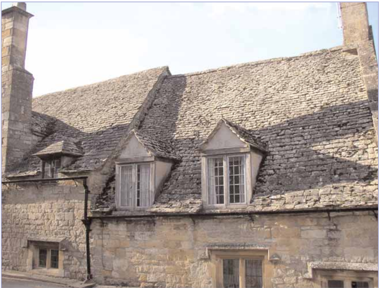
This view of the roofs of Green Close in Snowhill illustrates many of the craft techniques that form part of the Cotswold stone slate roofing tradition, which this guide describes.

Forest Marble is split by hand very shortly after being extracted from near the surface of the ground, usually at a small quarry. At one Cotswold quarry where slates were, until very recently, made by this method, it was thought that they should only be split within a few days of being extracted, while they still retained their natural moisture, or 'quarry sap'. Such stone slates are called 'presents'. This is the oldest method of producing Cotswold slates, probably dating from the Roman period.